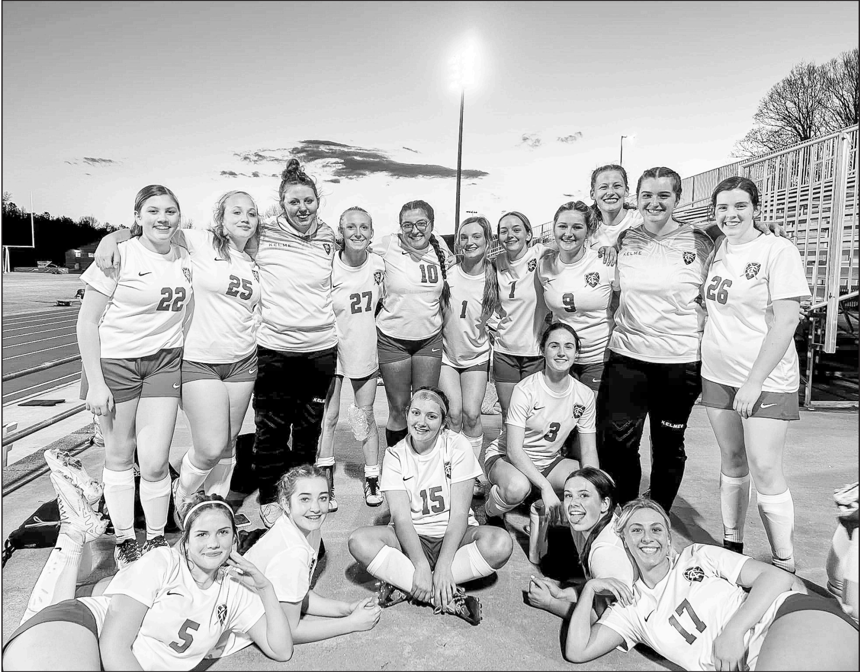
The Towns County Lady Indians following last month's victory over Class AA Banks County.

Indians 2, West Oak, SC 0 - After a disappointing 8-0 loss to Hart County a few days prior, the Towns County Indians soccer team showcased their resilience when they rallied