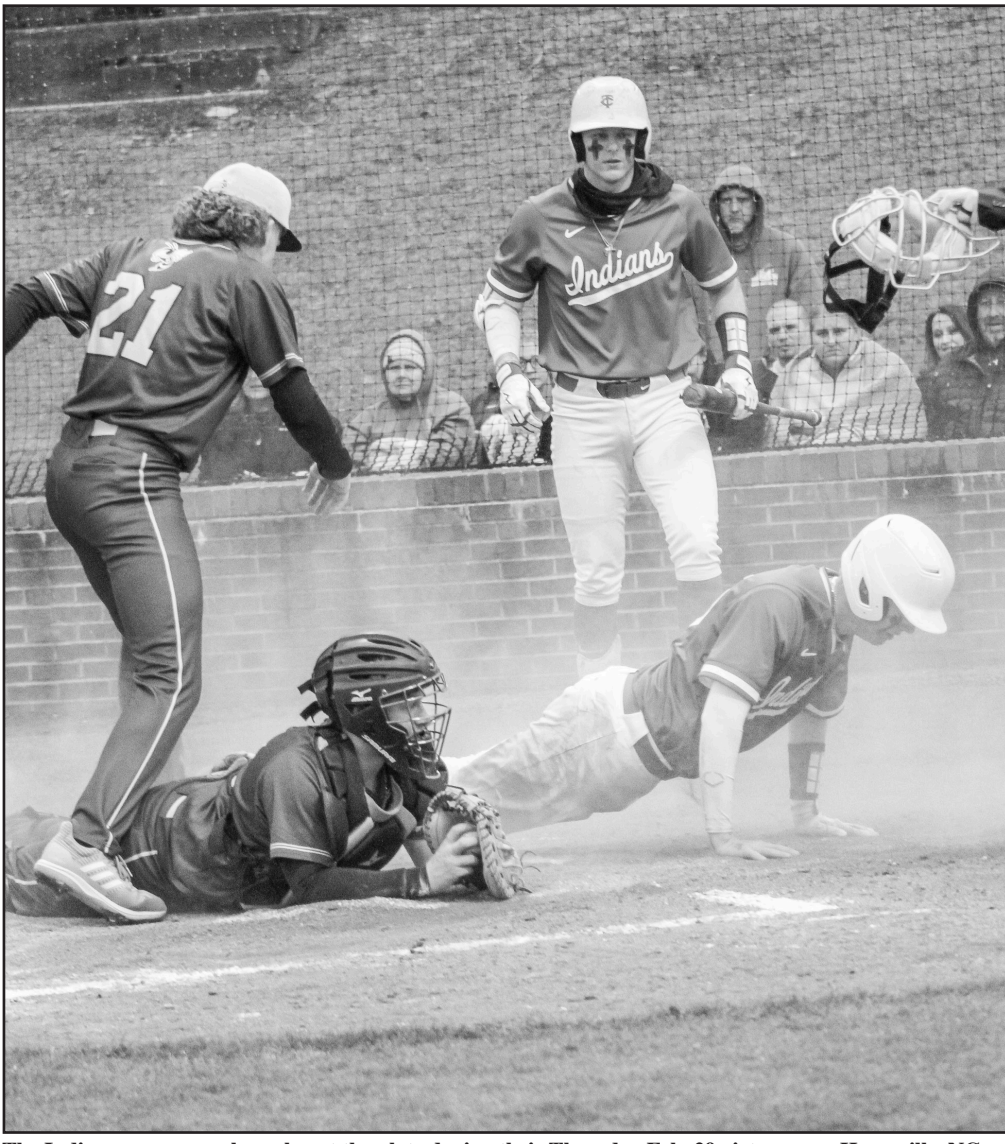
The Indians score on a close play at the plate during their Thursday Feb. 29 victory over Hayesville, NC.